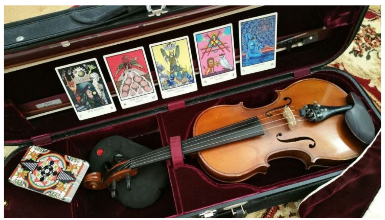
Yup, that's my violin, with the Tabula Mundi Tarot (by M. M. Meleen)

During your first 10,000 hours of lessons for mastering violin, it's about how you hold the bow, how to string your own instrument, how to straighten your own bridge, how to tune your instrument, how to hold a whole note with no vibrato, not allowing you to use any vibrato at all until you've mastered your bow work, then how to master the vibrato, perfecting the execution of various techniques, rote learning, stripping you of all personal creativity and compelling you to learn technique your teacher's way, playing boring scales and etudes until your fingers are blistered and your neck is bruised. It's hardly musical at all. You could argue that such an approach is stripping the musicality from music.