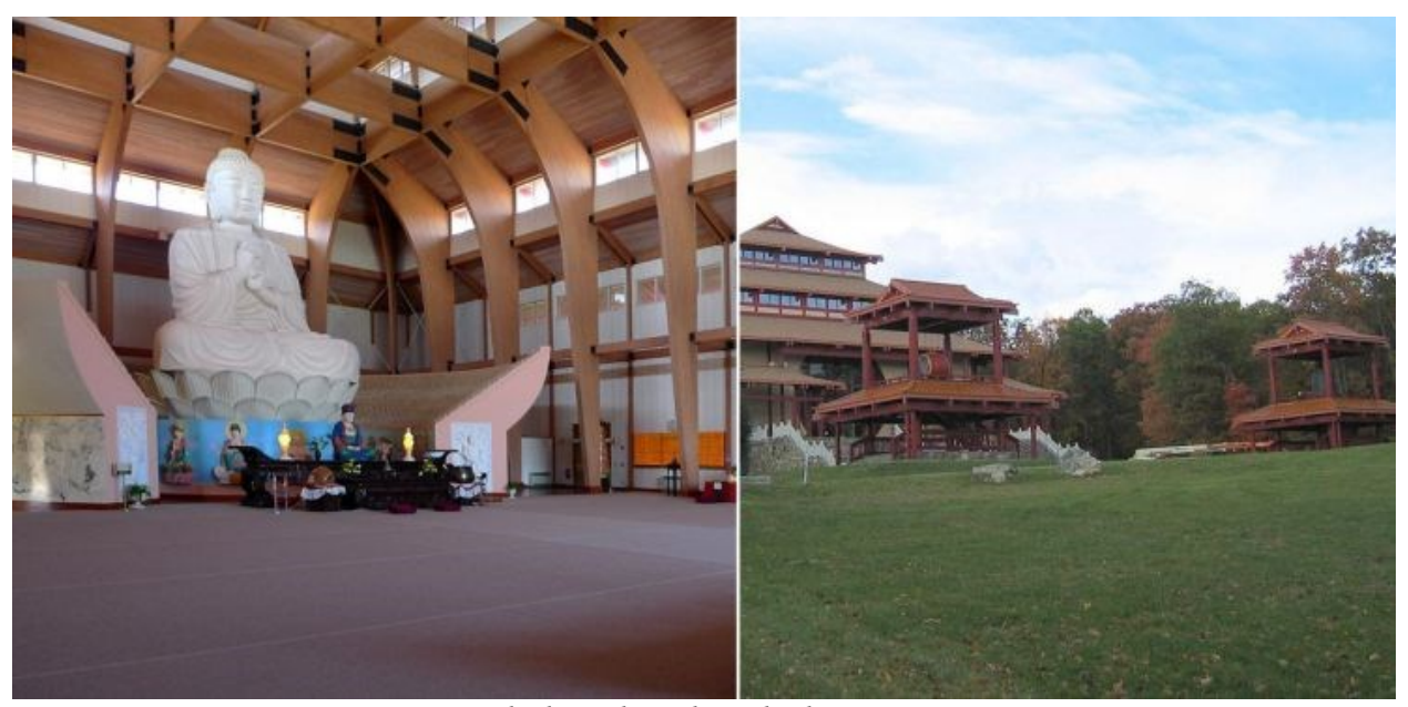
Boy do these photos bring back memories...

My favorite analogy for learning tarot comes from pop culture— the Karate Kid movies and how the first step of mastering martial arts is mastery over mundane tasks that seem to have nothing at all to do with martial arts ( wax on... wax off... ).